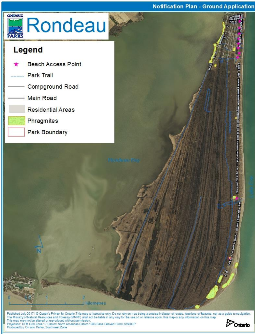
Figure 1: A map of Rondeau Provincial Park depicting proposed ground herbicide treatment sites for 2019