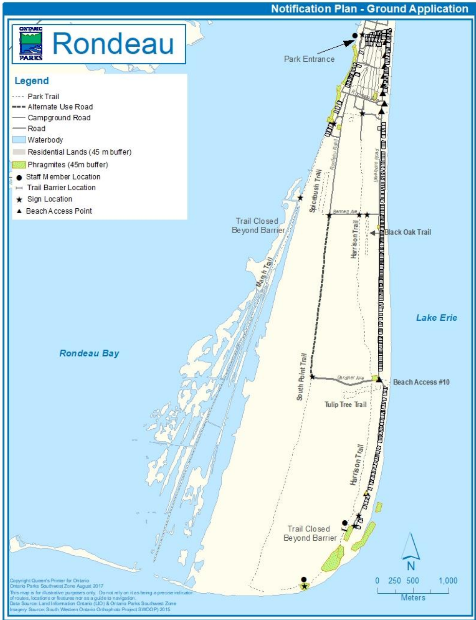
Figure 2: Map of notification locations for signs, barriers, and staff members during treatment.